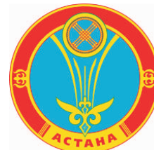
Astana City Mayor's Office